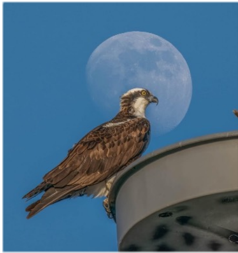
osprey and moon, XKT Engineering nest tub placed as a deterrent. Mare Island, Vallejo, CA