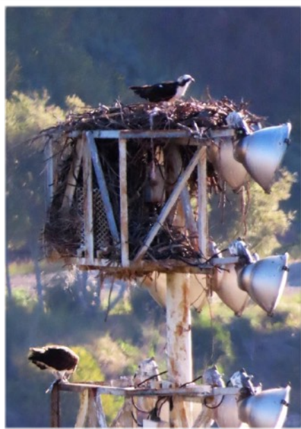
osprey nest on light pole on a pier in the former Mare Island Naval Ammunition Depot, Napa River/ Mare Island Strait Vallejo, CA

Finally, following Tony's presentation, you will be able to view and share via Facebook Live, Zoom and Youtube. (Please be patient while we post early in the following week)