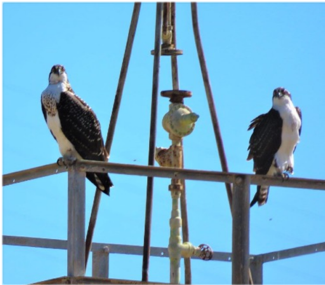
female osprey, left and male, right perched on the scale test structure in the former Mare Island Naval Ammunition Depot, Vallejo, CA