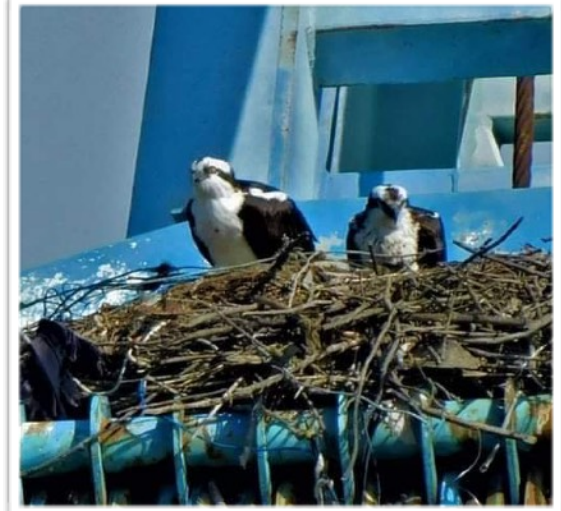
Osprey nest perched on former nuclear rod refueling crane, Drydock 2, Mare Island Drydocks Napa River/Mare Island Strait, Vallejo, CA