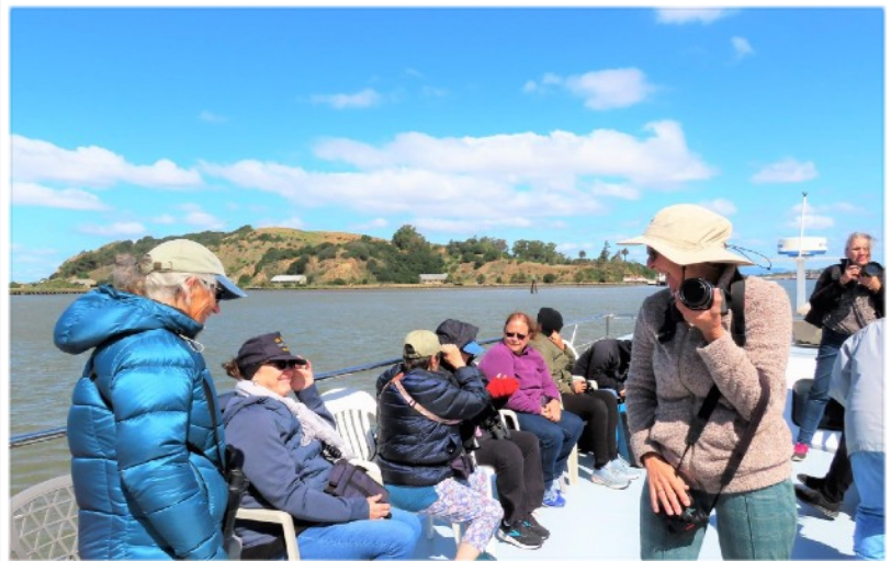
Osprey Days participants aboard River Dolphin on the Napa River/ Mare Island Strait Vallejo, CA with Mare Island Shoreline Heritage Preserve in the background. The former Mare Island Naval Ammunition Depot, founded 165 years ago this year, was opened to the public for the first time, in 2007 by volunteers of the Mare Island Heritage Trust with the US Navy and its contractors, Weston Solutions, Inc. and the City of Vallejo. Please help us return to the management of this special wildlands park, by signing the petition on our website, mareislandpreserve.com Thank you!