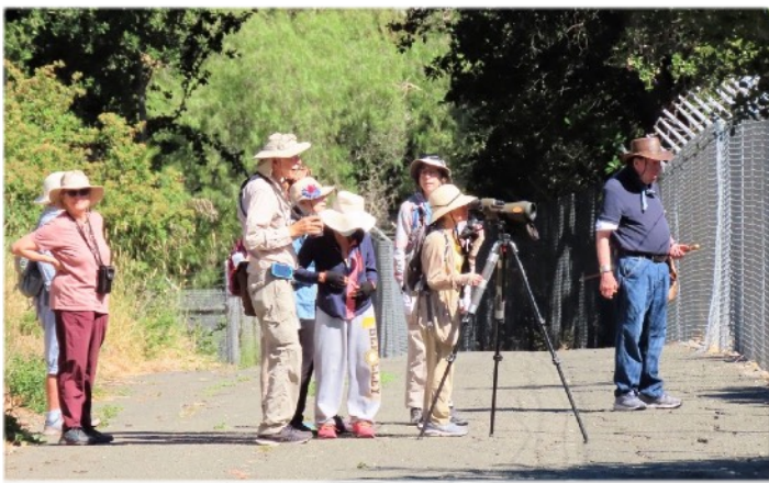
birdwatching group viewing nesting osprey, Mare Island Preserve