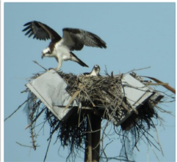
Osprey on lightpole nest, Berth 24 Near Mare Island Preserve entrance