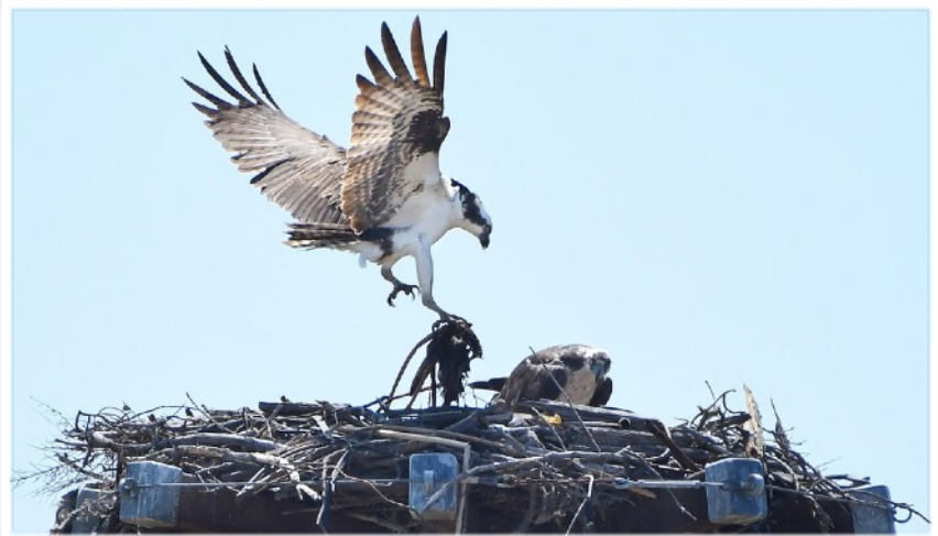
Photo: Mare Island osprey returns to nest with crow. (not a food source)

Osprey nesting in the Bay, still so novel with no recorded nesting in the 20th or 21st century or in the ancient shellmounds. Yet, around the world, the same species soar, dive, fish, nest, feed and fledge their young. . .